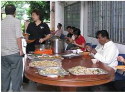
Food, Glorious Food!

The graduation of the UMDF's 1 st Dhamma Speakers Course was to be held in January 2008. After two long years, fourteen of us who had fulfilled the minimum requirements would be allowed to graduate. We planned eagerly for the ceremony. We would have an organic vegetarian dinner – as our gift to our coordinators, our mentors and all our supporters from the various Buddhist societies. They had given us something priceless – their time, energy, love and commitment. We would never be able to give them anything else to reciprocate their priceless gift to us. Since the Buddha said that “Health