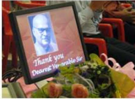
I am here today because of Chief.