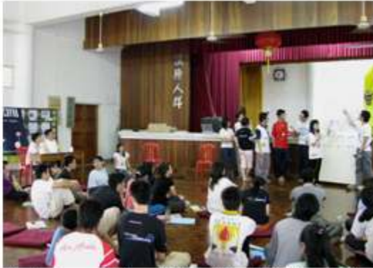
Youth Camp at Klang & Coast Buddhist Association.

While it takes a lot of effort, perseverance and commitment to become a Dhamma speaker, the joys and rewards are tremendous. Not only have I learnt so much more in my own knowledge and experience of practising the Dhamma , I also find myself practising certain aspects of the Ten Paramis such as viriya (effort), sacca (honesty) and aditthana (determination).