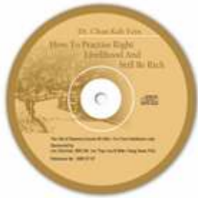
My first Dhamma Audio CD