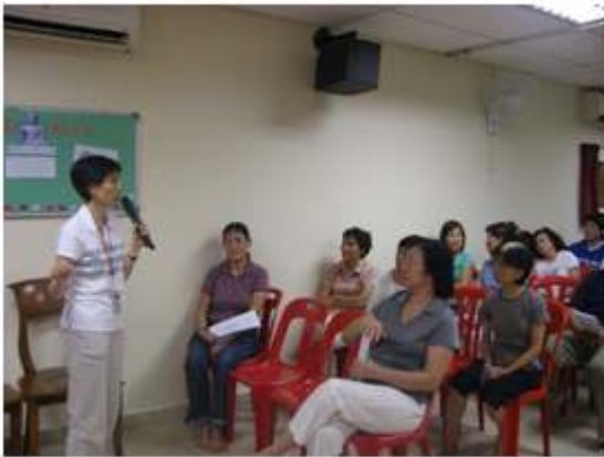
At "home", in Ti-Ratana, Klang, where is there an endless flow of love and warmth.