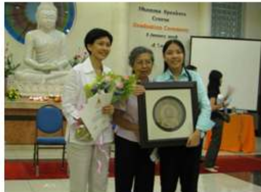
One for the family album - my mother, my daughter and me.