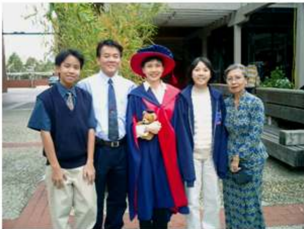
My family with me at my Ph.D. graduation, October 2004.

It was very hard at the beginning. As a mother of two relatively young children, my life was already packed to the brim with household chores and responsibilities. I would go to work in the morning, rush back with lunch for one child, then take him to school and fetch the other back from school. Then, it was often the endless rounds of ferrying them to and fro until late at night. This was of course thanks to the ubiquitous tuition classes, a malady that has afflicted modern-day society due to sad and uncontrollable circumstances (and this issue can be a topic for another book which I shall certainly not attempt to write!). Besides being an unpaid chauffeur, I also had to run errands, clean the house, cook – well, pretty much everything that a modern-day working mother has to do. I had no domestic helper too.