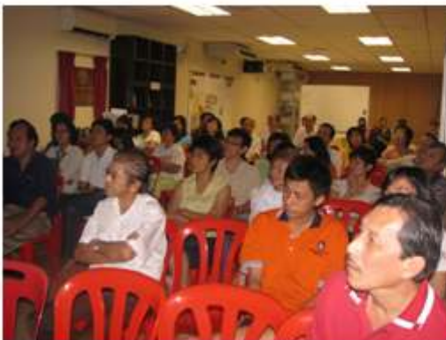
At Ti-Ratana Community Centre, Klang

Sharing the Dhamma also brings me the joy of cultivating the Four Brahmaviharas of metta , karuna , mudita and upekkha . Metta (loving-kindness) to all beings who would benefit from our talks. Karuna to the devotees who trust us enough to share their problems. Mudita , when we share the success and happiness of others, and when others rejoice with us. And Upekkha when things get tough, and the tough must rise up and remain standing. Upekkha is also called upon when everything is running smoothly because we must remember that all conditioned things are impermanent, and change is the only truth in our samsaric existence.