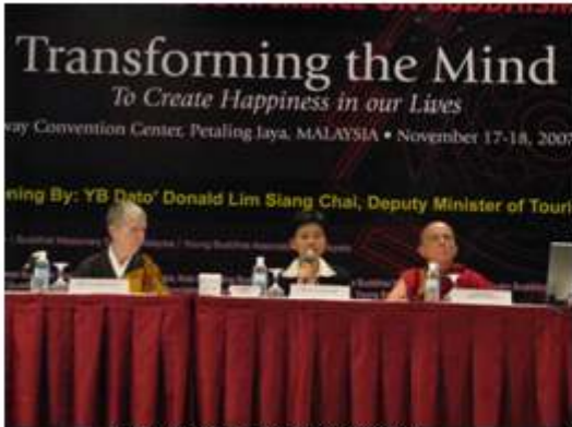
Can you see me shivering?