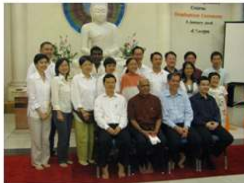
Going forth...to spread the Dhamma far and wide!