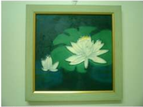
The painting that hangs on my wall. A reminder...to be like the lotus.

how much it means to me to be able to finally do some Dhammaduta work after having spent the last two decades devoting all my time to the home and the family.