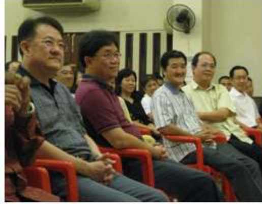
Our mentors and friends.