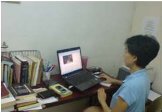
Researching late into the night AND hounding mentors with questions, through the email.