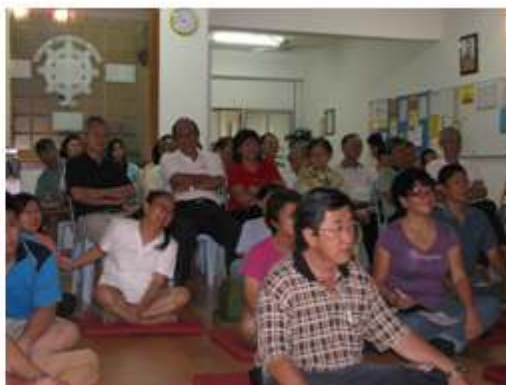
At Mudita Buddhist Society, Klang