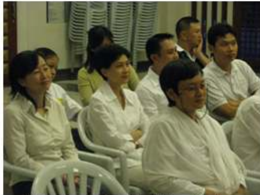
All of us dressed in white, in the spirit of camaraderie.