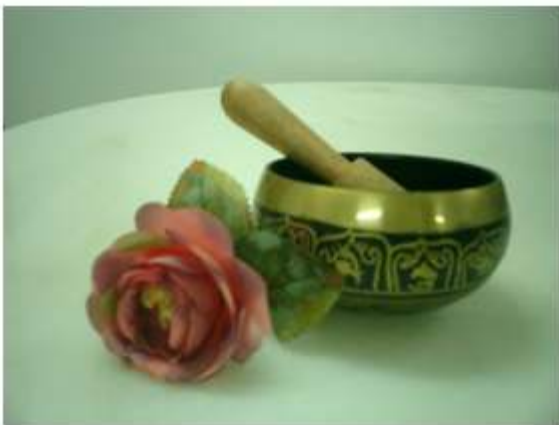
My singing bowl.