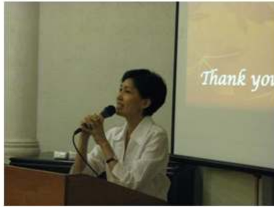
Thank you, everyone.....

As I now begin on my journey as a Dhamma speaker, I remind myself of the Buddha's words, Yo Dhammam desesi. Adikalyanam, Majjhekalyanam, Pariyosanakalyanam . I am thankful that I have been given this beautiful opportunity to continue turning the wheel of the Dhamma , as others have before me.