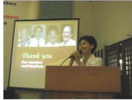
We thank you from our hearts, dearest mentors