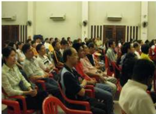
Kalyanamittas who came to rejoice with us.

The DSC started with a bang, and we all hoped it ended with a bang too. As I said in my address to the audience that evening, this graduation marked the beginning, not the end. Now comes the hard part where we would have to go out, be on our own, and spend the rest of our lives fulfilling our pledge of sharing the beautiful Buddha- Dhamma with others.