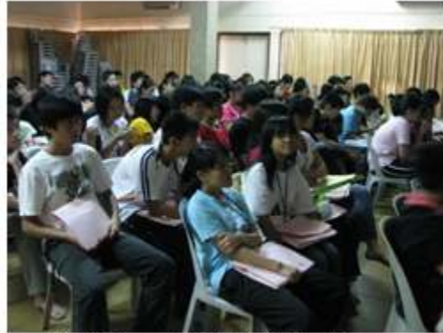
Youth Camp at Buddhist Maha Vihara.

Sharing the Dhamma also brings me the joy of cultivating the Four Brahmaviharas of metta , karuna , mudita and upekkha . Metta (loving-kindness) to all beings who would benefit from our talks. Karuna to the devotees who trust us enough to share their problems. Mudita , when we share the success and happiness of others, and when others rejoice with us. And Upekkha when things get tough, and the tough must rise up and remain standing. Upekkha is also called upon when everything is running smoothly because we must remember that all conditioned things are impermanent, and change is the only truth in our samsaric existence.