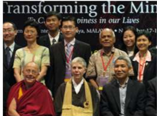
One for the album. An experience of a lifetime.

The 5 th global conference was a resounding success in every way. Everyone came away with a great sense of having learnt something new, and being inspired to put the sublime teachings into real-life practice. I was very thankful to be a part of this event. I count this as another memorable milestone in my life.